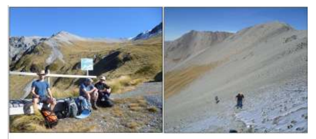
Nervous Knob, Craigieburn Range