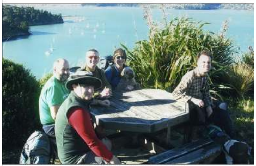
Pony Point, Lyttelton Harbour